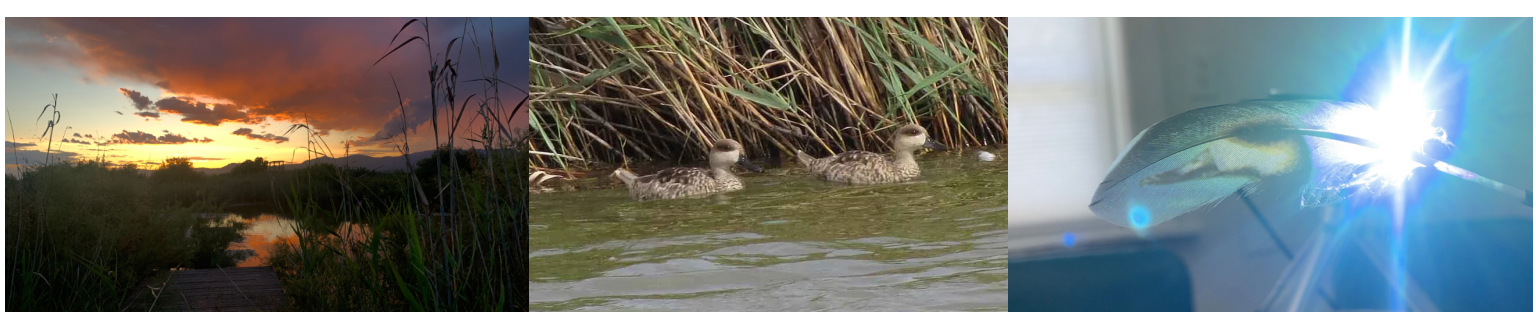
an encounter with the wetland