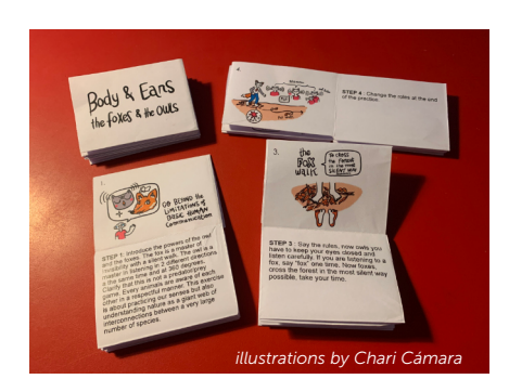
Creative Commons resources